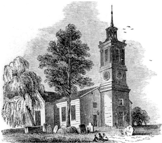
Artist's rendering, St. John's Church, Richmond, VA

Patrick Henry. "A brilliant orator, a firebrand for freedom and individual rights. He stands as an American luminary."