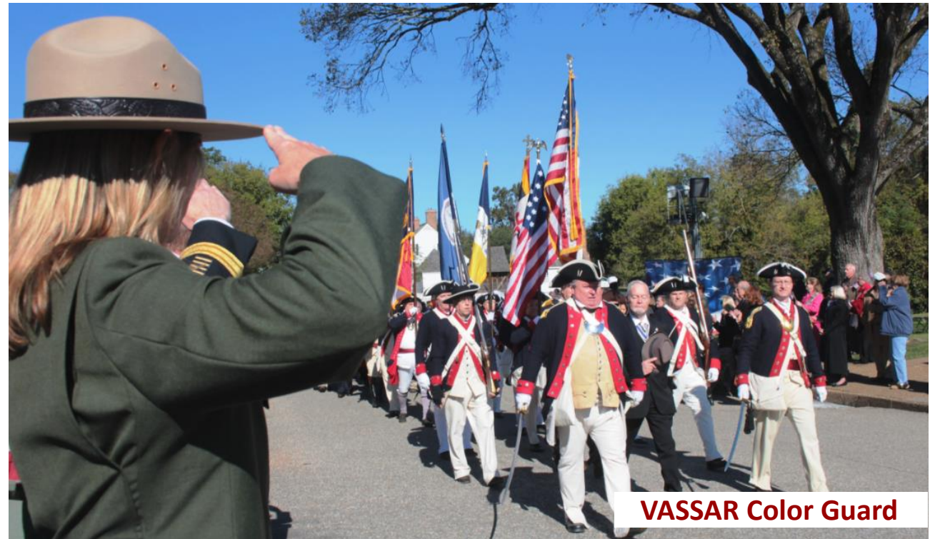
VASSAR Color Guard