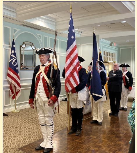
Please see color guard member names, below