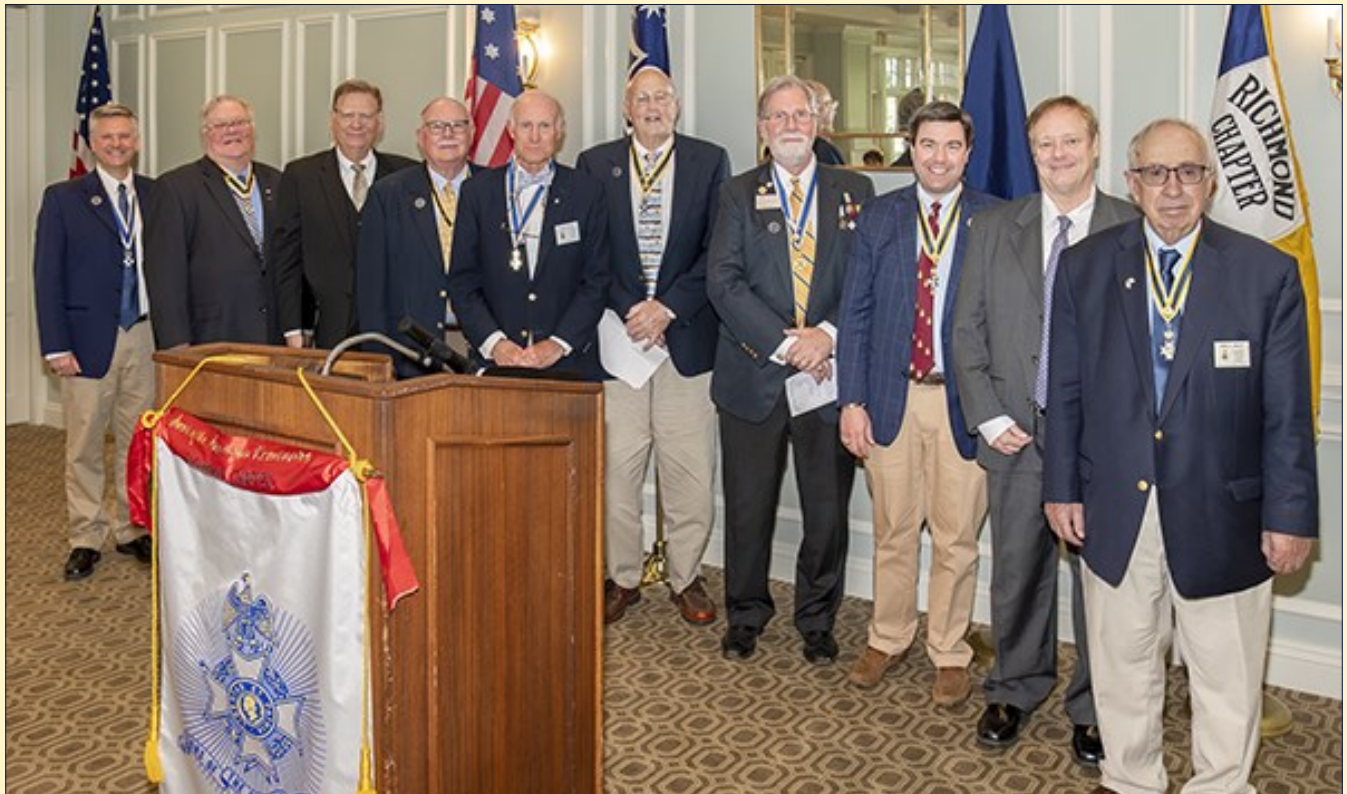
All attending Richmond Chapter Presidents