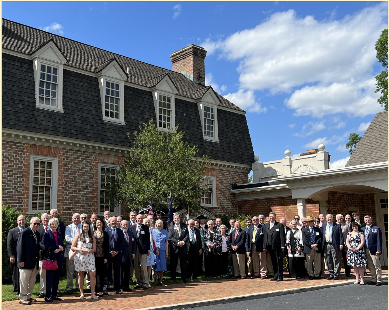
The official Richmond Centennial Celebration group photo