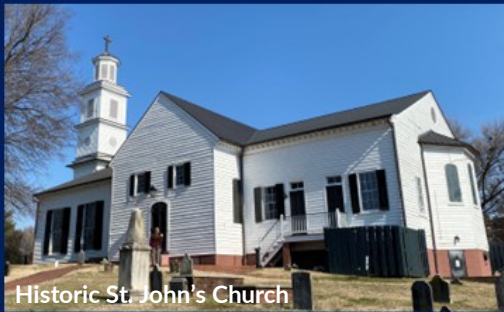
Historic St. John's Church

Attendees from multiple states participated in laying more than 20 wreaths representing SAR, DAR and CAR Societies, The Staunton River Foundation (which promotes,