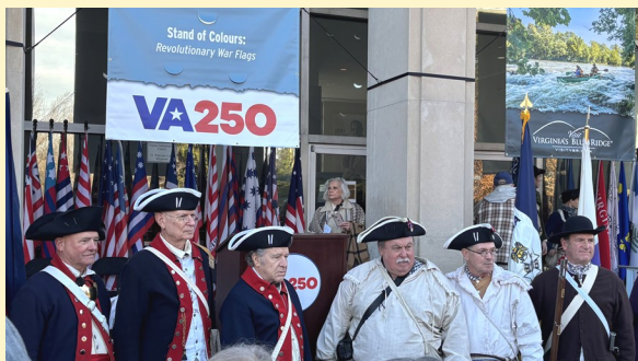
The Virginia SAR Color Guard at the Roanoke History Museum

The Virginia SAR joined the Virginia America 250 Committee and other historical organizations in Roanoke, on January 18, to observe the 250 th anniversary of the Fincastle Resolutions. The resolutions were signed by 15 Virginia frontiersmen, in 1775, as a show of support of the Continental Congress voting