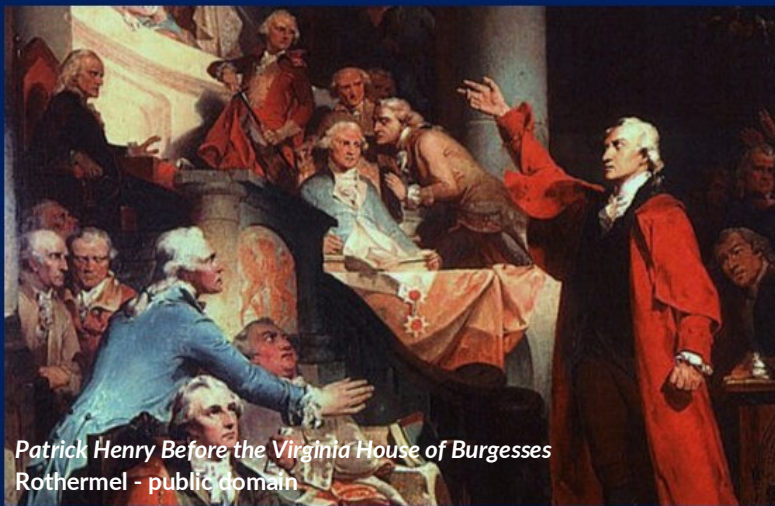
Patrick Henry Before the Virginia House of Burgesses

develops and preserves the Carrington homestead (Mulberry Hill Plantation) and the General Society of the Order of the Founders and Patriots of America.